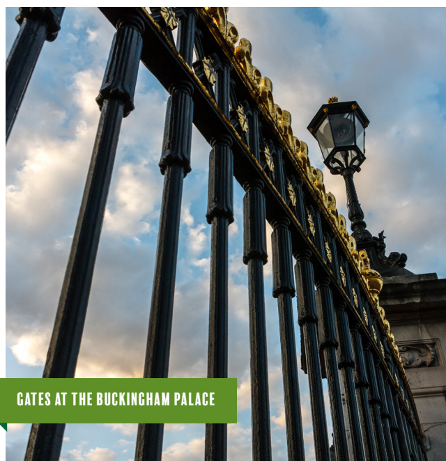
GATES AT THE BUCKINGHAM PALACE

THE CURRENT WESTMINSTER ABBEY DATES BACK THE 13TH CENTURY, HOWEVER EDWARD THE CONFESSOR CONSTRUCTED THE FIRST CHURCH ON THAT SITE IN 1065,