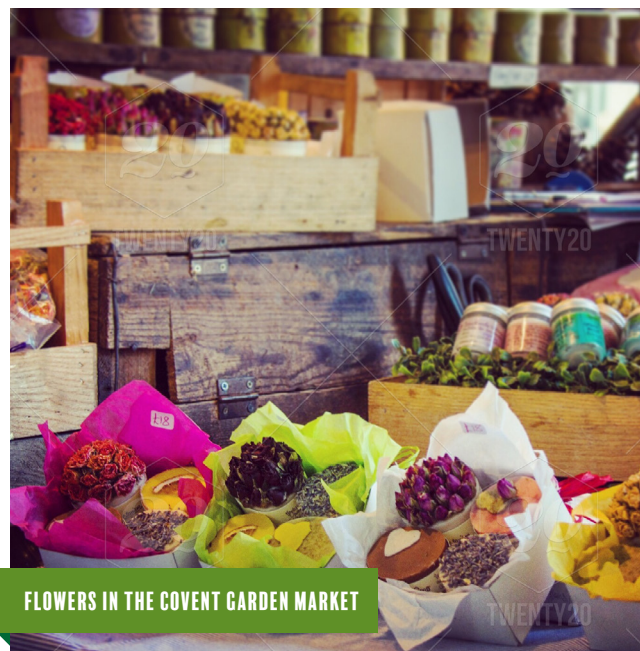
FLOWERS IN THE COVENT GARDEN MARKET

Once you've been on The London Eye, enjoy the green of Jubilee Gardens, take in the views and do a spot of people watching! From here, it's a short walk to the Waterloo Tube where you can make your way back to your accommodation.